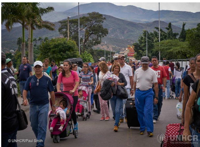
Every day thousands of Venezuelans, Colombian returnees and mixed families cross the Simon Bolivar Bridge in Cucuta, Colombia, to and from Venezuela.