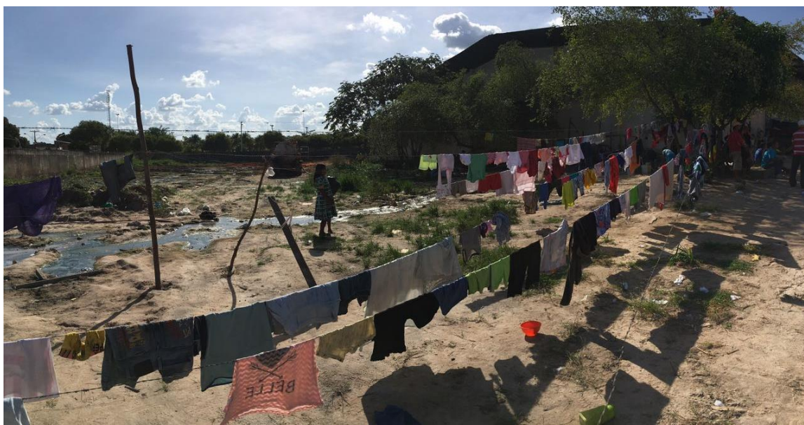
People continue to live under precarious conditions in the Boa Vista shelter. A laundry area and new toilets will be constructed, once earthworks are concluded.