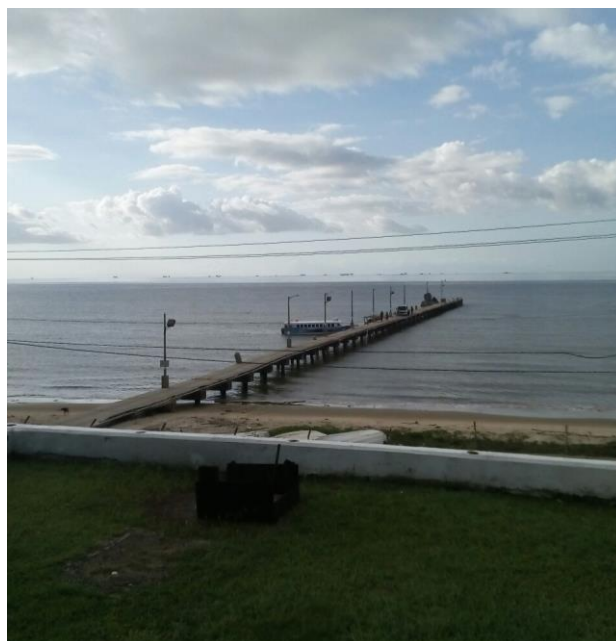
In Trinidad and Tobago, the Cedros Dock serves as entry point from Tucupita, Venezuela