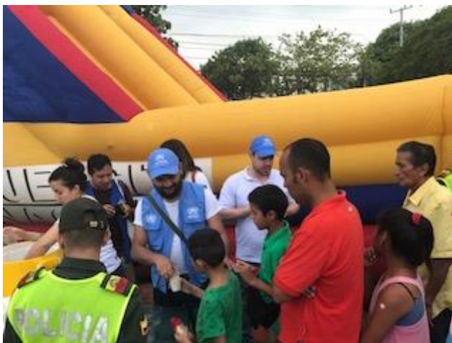
The new Field Unit in La Guajira provides legal orientation and basic assistance to 500 Venezuelans.