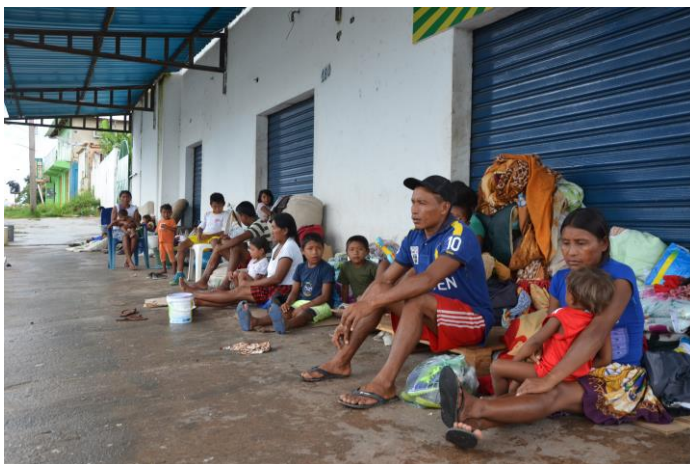
Many Warao indigenous persons who travelled over 2,000 km are living on the streets of Pacaraima, resorting to begging as a result of the lack of livelihood opportunities.