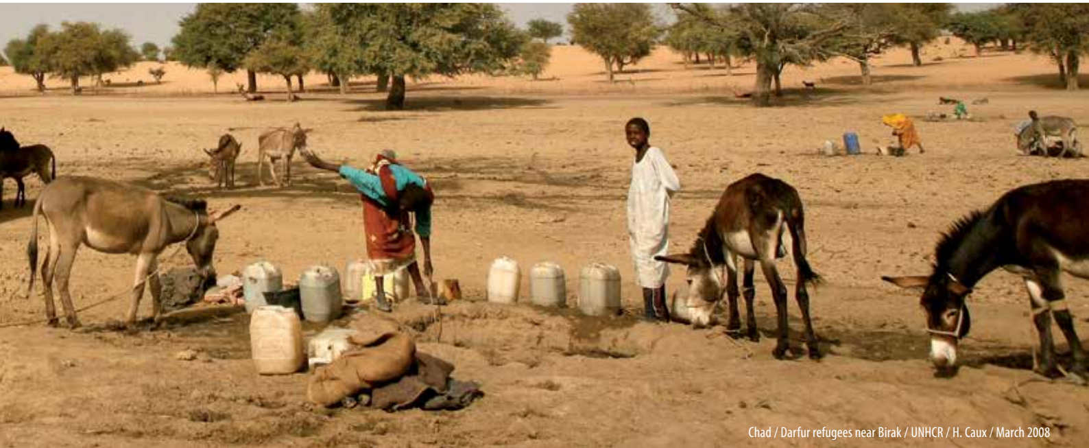
Chad / Darfur refugees near Birak / UNHCR / H. Caux / March 2008