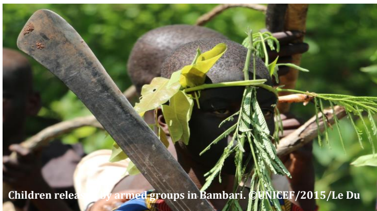
Children released by armed groups in Bambari.