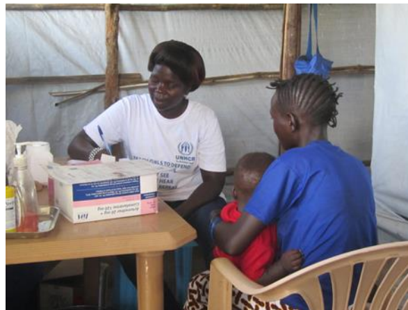
Medical screening at the Biringi site's temporary health post which will soon be replaced by a new ward. June 2017