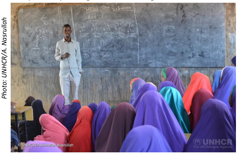
Refugee students in their classroom at Hurmod primary school, in Ifo camp.

• For the period 20<sup>th</sup> to 22<sup>nd</sup> February, a team from Humanitarian Educational Accelerator (HEA), World University Service of Canada (WUSC) and American Institute of Researchers (AIR) was in Dadaab to conduct a training on evaluation of remedial classes programme. The project which will be implemented by WUSC and Windle Trust Kenya (WTK) seeks to provide impact evaluation evidence of WUSC's remedial education model through process evaluation and rigorous monitoring. In the process, the project will also build capacity of both WUSC and WTK's ability to carry out rigorous Monitoring & Evaluation in the future. As an outcome, the project will document how