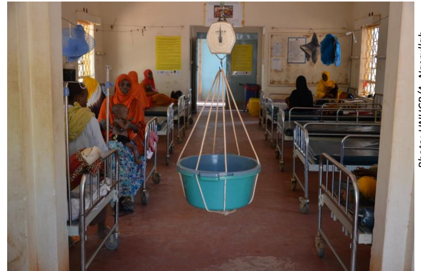
Acute malnutrition stabilization ward in Ifo camp hospital of Dadaab.