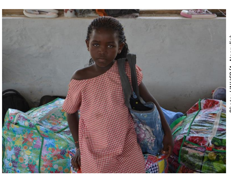
A nine-year-old refugee girl from Congo pose for a photo at the Ifo camp transit center where they overnight before leaving for Kalobeyei, Kakuma.

During the month of February, 376 households / 1,423 individuals relocated from Dadaab to Kalobeyei in Kakuma. A total of 894 households / 2,891 individuals have been relocated since the process started in November 2016.