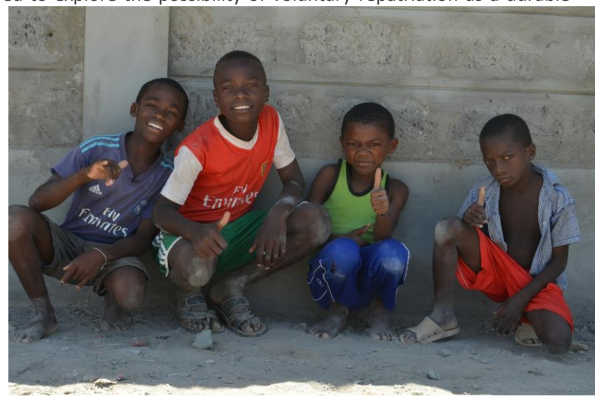
Refugee children in Ifo camp of Dadaab.

The monthly Child Protection Working Group meeting was held on 27<sup>th</sup> February. In attendance were Save the Children International (SCI), Terre des Hommes (TDH), Film Aid, Danish Refugee Council (DRC), KRCS and UNHCR. Issues discussed included: monthly activities update from partners, updates on the voluntary repatriation and relocation process, preliminary review of Child Protection issues arising from the participatory assessment