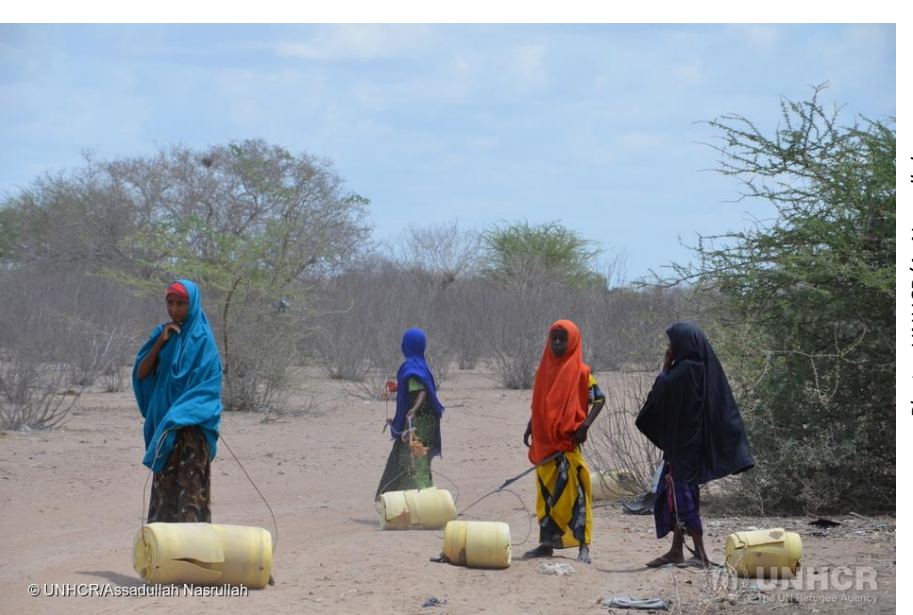
Children from the drought affected host community villages walk long distances to gather water for their families.

Drought mitigation meeting: UNHCR participated in a drought mitigation organized meeting by National Drought Management Authority in Garissa on 17<sup>th</sup> February to update on the drought situation in the county, which has affected both the host communities. and the refugee populations in Garissa. The meeting noted that key sectors like water, livestock and education has been affected putting constraints on the little available resources. This has the potential of causing conflicts amongst the nomadic communities. UNHCR shared that water trucking to 16 villages in Dadaab and Fafi has commenced and UNHCR was also repairing boreholes for both short and long term interventions of the