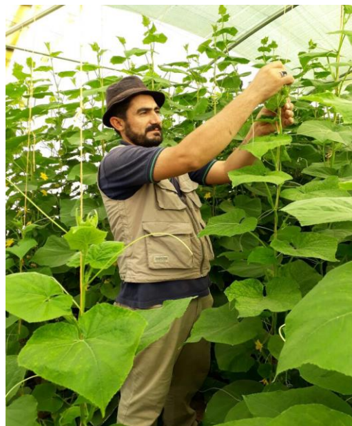
FAO green houses in Qushtapa camp.

In Qushtapa and Domiz 1, 20 units of greenhouses were set up for the purpose of training refugees and the host community on vegetable production. The Ministry of Agriculture provided the land, and the greenhouses will be used for training on technical and practical procedures used for production of vegetable crops in a simple approach, both theoretically and practically during the crop growing seasons up to the crop harvesting, vegetable storage, processing and marketing. With micro-gardens, vulnerable people are engaging and participating in rebuilding their future and harvest every day, fresh, safe and highly nutritious vegetables for the improvement of their diet with vitamins, essential micro-nutrients and vegetable proteins.