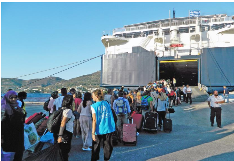
UNHCR assist the transfer of asylum-seekers from Samos to mainland Greece

1 Islands Unit in Athens 1 Sub Office on Lesvos 5 Field Offices on Chios, Samos, Kos, Leros and Rhodes