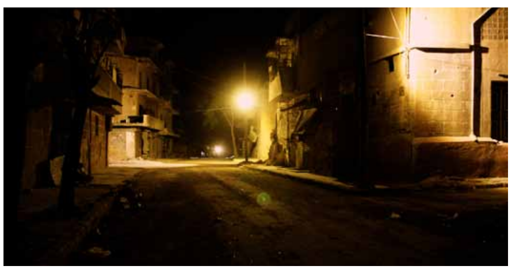
In east Aleppo, six months on from gaining access there, UNHCR-backed programmes have brought street lights to dozens of streets. For example, in the Karm Al-Sabbgh neighbourhood in east Aleppo where the scale of destruction is massive, street lights are changing the quality of life for the 560 displaced people who returned recently to their homes there.