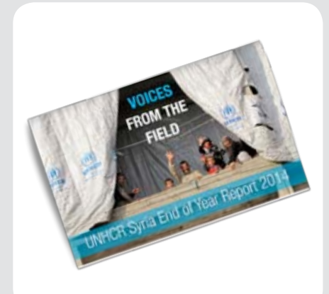
UNHCR 2014 END OF YEAR REPORT "Voices from the Field" Available Now

Refworld: http://www.refworld.org/docid/54f814604.html