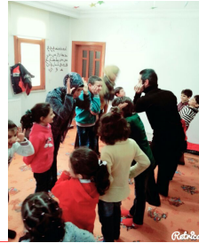
IOM - Recreational activities at IBC Istanbul

UNICEF has established CFS in Kilis province, which has suffered repeated shelling since April 2016. The CFS offers psychosocial support (PSS), recreational activities and specialized child protection services to up to 3,000 children per month, with a focus on the most vulnerable and