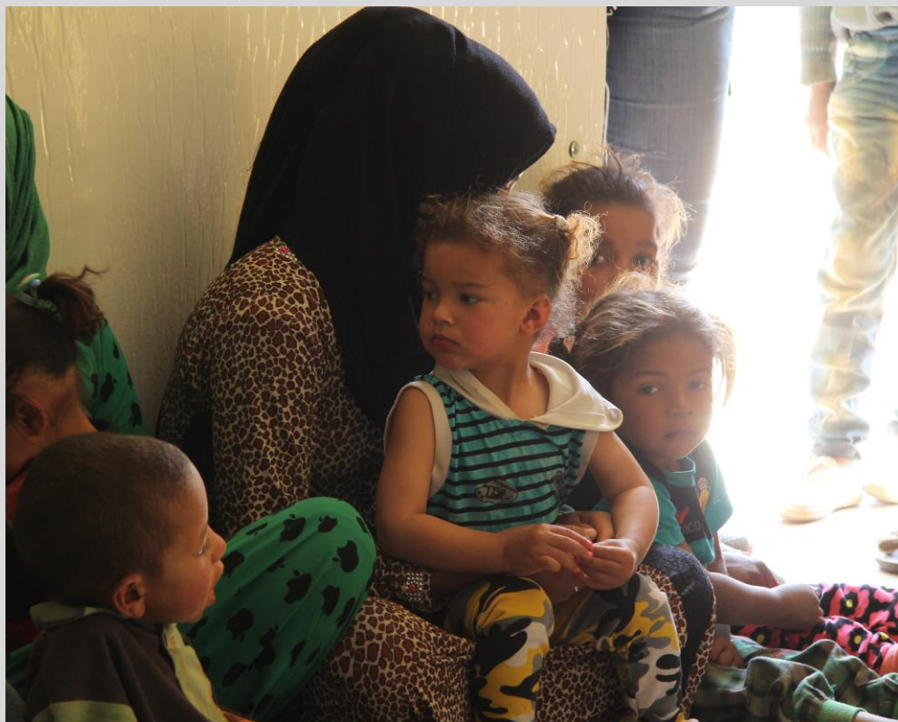
Syrian refugee women participate in an outreach session on education in the Bekaa.