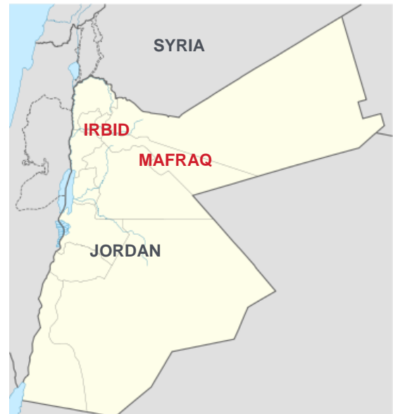
Map 1 | Map of Jordan with Irbid & Mafrq

In Mafrq, 65% of (non-farm) enterprises are commercial (food retail, clothing, household goods), 14% are industrial (metal industries, leather & textile), 6% are tourism, and 4% are services. In Irbid, 34% of the work force is in public administration, 14.7% in education, 13.2% in wholesale and retail trade, 7.2% in transportation and warehousing, 4.7% in healthcare and social services, 2.7% in agriculture and 1.7% in tourism 6 .