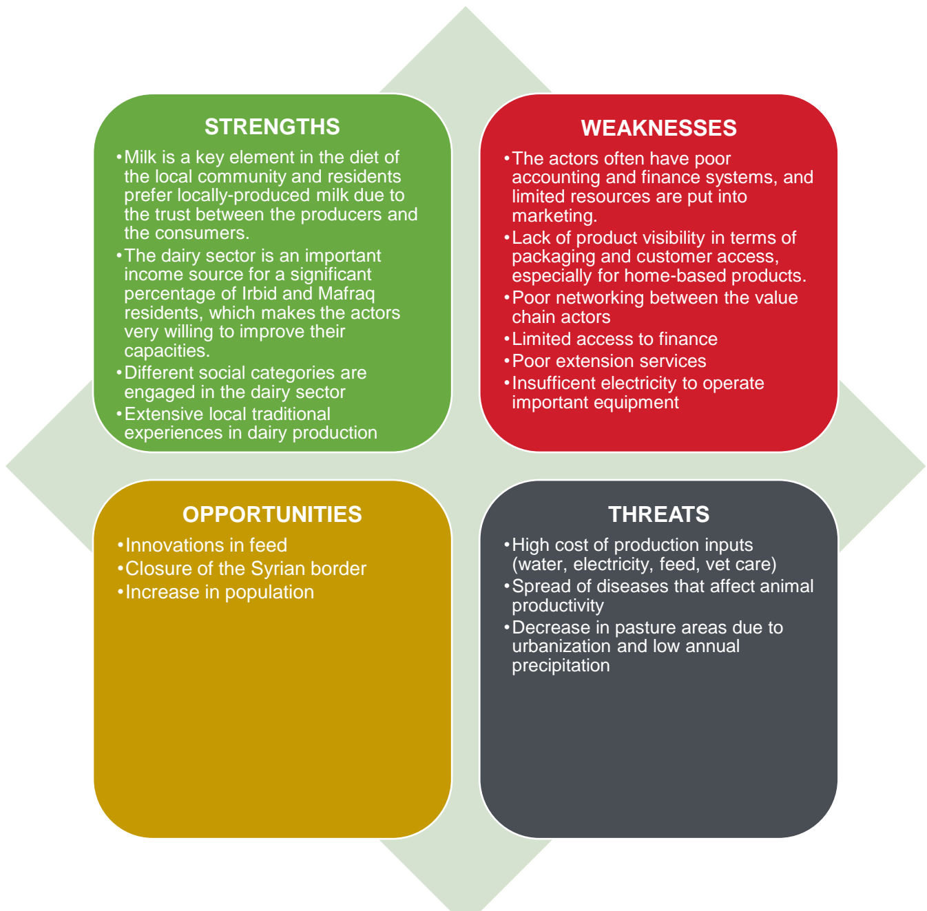
Chart 2 | SWOT Analysis