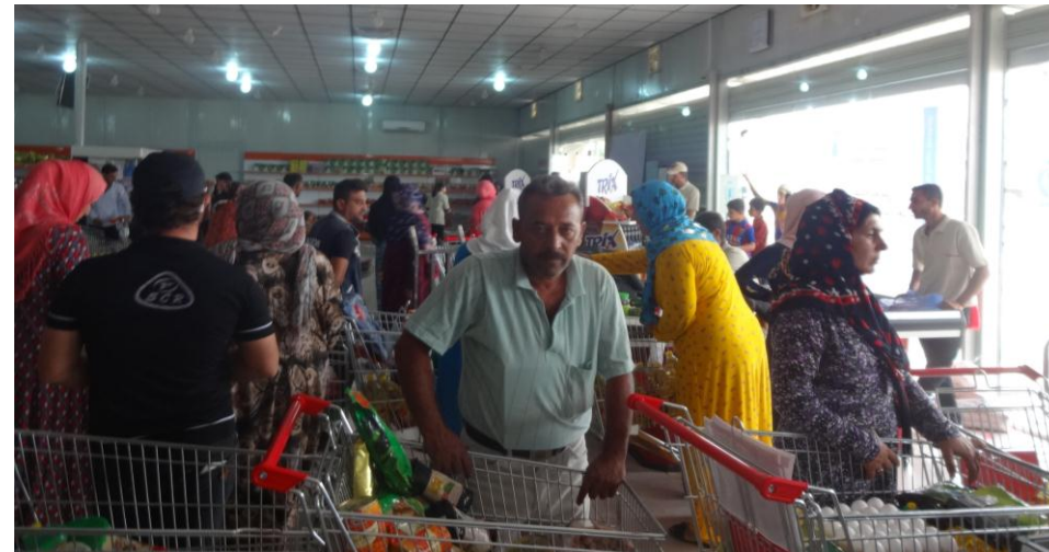
Voucher redemption, Basirma camp, Erbil

For the eighth month this year, WFP was unable to deliver food commodities to Al-Obaidi camp and distributions of individual food parcels did not take place. UNHCR through its local partner ISHO continued providing food assistance: Baking and distributing 2 pieces of bread per refugee per day for all camp population benefiting 938 refugees (including unregistered refugees). Complementary food assistance value 17,500 IQD (total beneficiaries 697 refugees with total amount 12,197,500 IQD). Cash for food valued 25,000 IQD/month (benefiting 925 refugees).