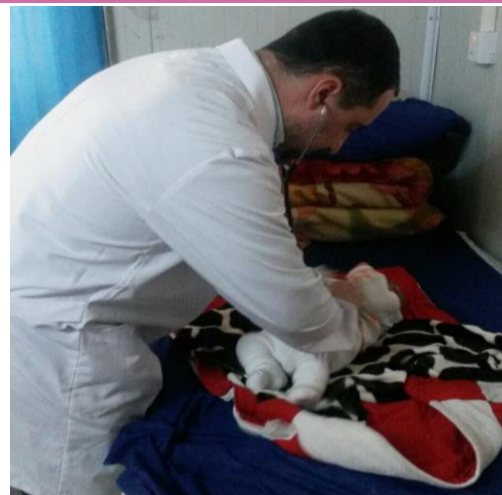
A medical doctor from DoH-Erbil is examining a child, Darashakran refugee camp PHCC, Erbil