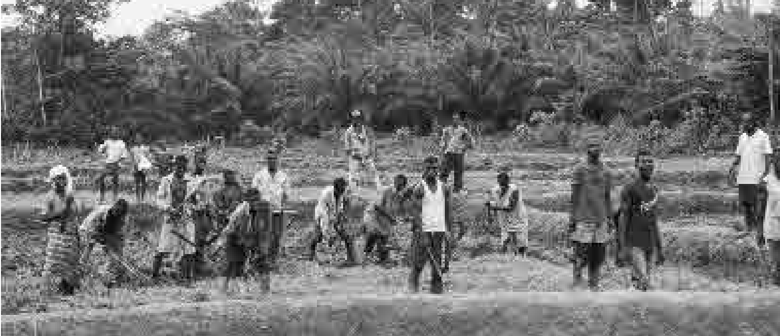
Farming land is not always available to refugees. Here, Liberian refugees work on a UNHCR-funded rice growing project.

economic self-reliance, refugees will have access to micro-credit projects and vocational skills training in the ZAR. UNHCR's local integration activities in the refugee-hosting area will aim at benefiting not only the refugees, but also their host communities. Efforts in this direction will be augmented by the Projet de réhabilitation de la zone d'accueil des réfugiés , providing that the security situation improves and the PR-ZAR can be continued.