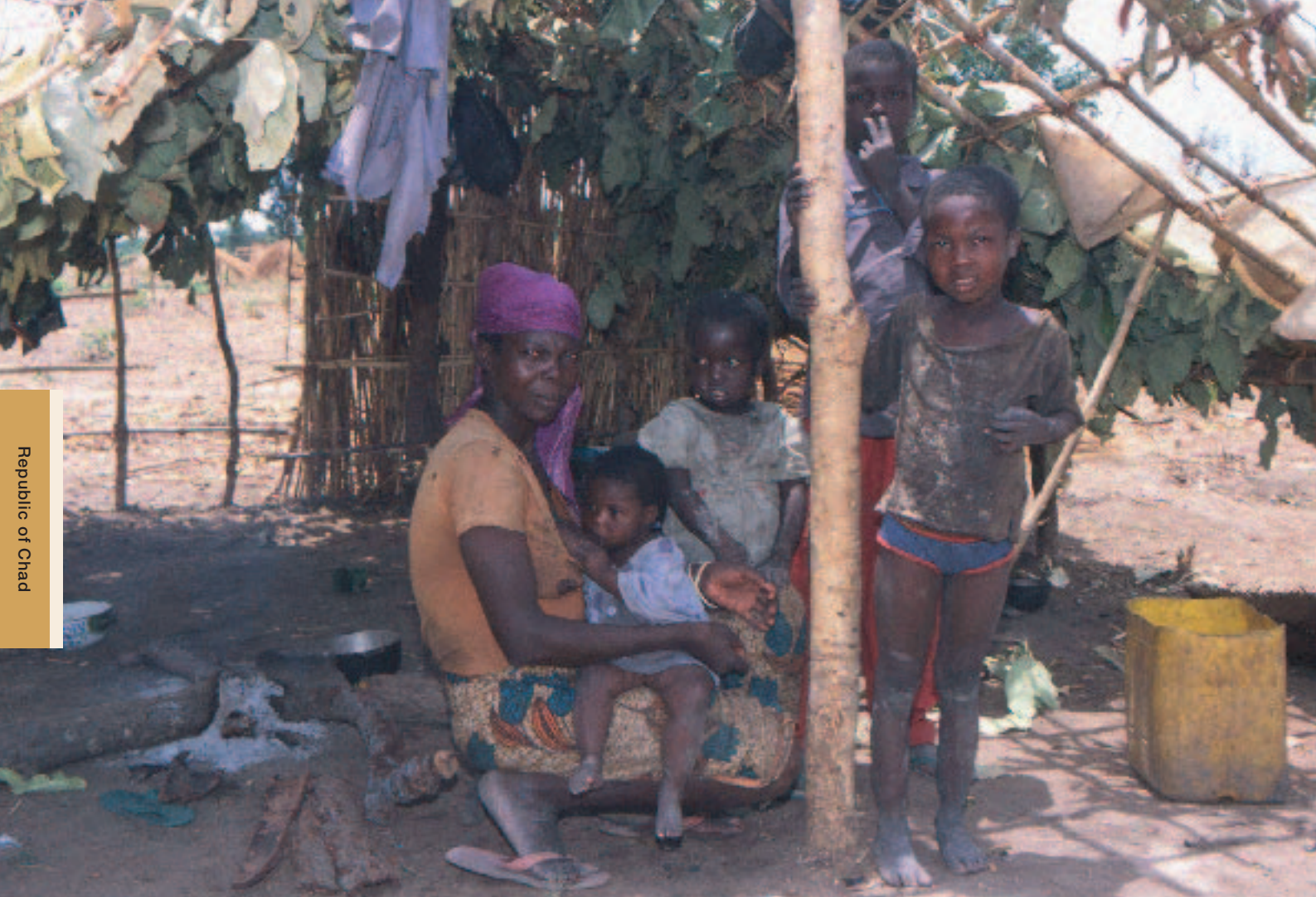
Many of the refugees who fled to Chad have been living in the open without adequate shelter. Here, a woman and her children, the majority of those who fled the fighting in Darfur – western Sudan, are settling down in newly established camps.

and the procurement of related equipment (pumps, pipes, chemicals and water purification tablets, etc.). In the sanitation sector, adequate facilities must be put in place for the effective removal of garbage, vector control and proper management of contaminated water. Minimum standards of health care will be maintained through the provision of preventive and emergency curative health services and education (in the first instance covering water usage, sanitation, and care of the environment).