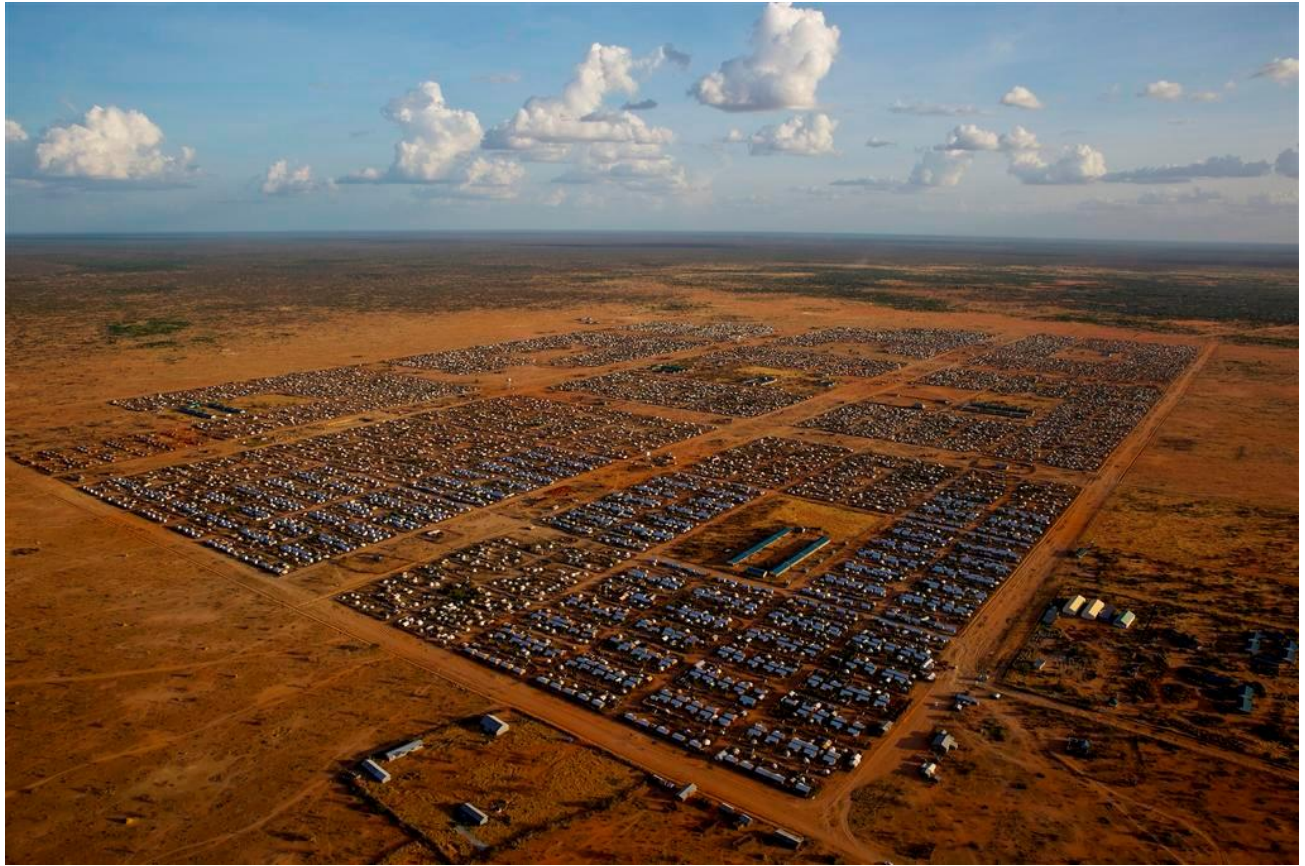
Ifo 2 from the air