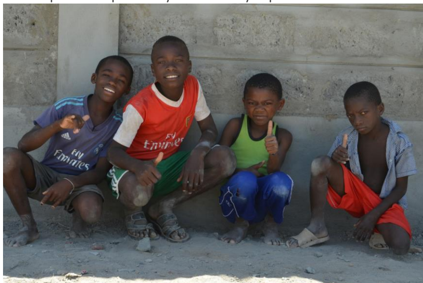
Refugee children in Ifo camp of Dadaab.