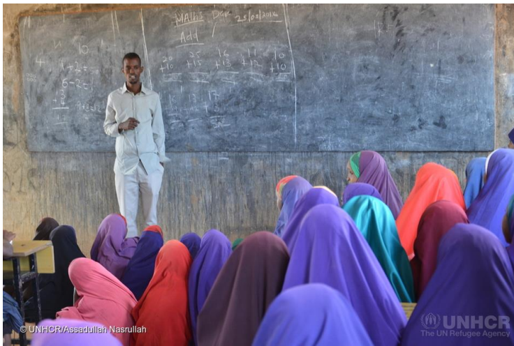
Refugee students in their classroom at Hurmod primary school, in Ifo camp.