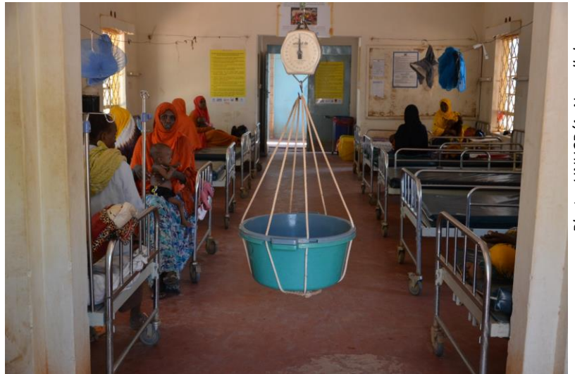
Acute malnutrition stabilization ward in Ifo camp hospital of Dadaab.