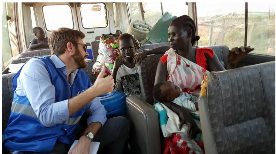
UNHCR staff in Malakal welcoming Internally Displaced families from Melut Protection of Civilian (POC) site who voluntarily relocating to Malakal POC site.