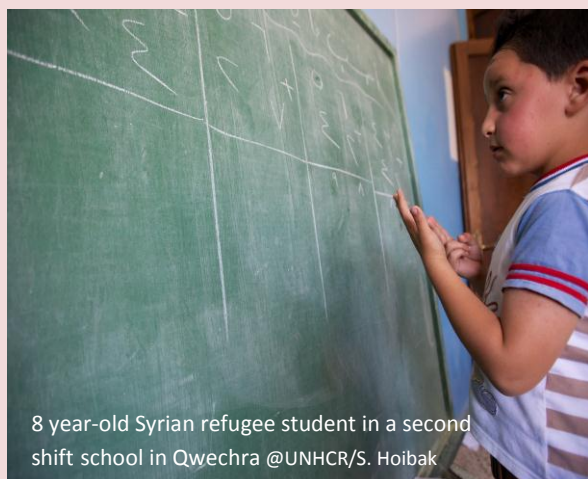
8 year-old Syrian refugee student in a second shift school in Qwechra

Uprooted from their homes and schools in Syria, refugee children need to continue their education in Lebanon. Education is a key protection tool and prepares refugee children to lead healthy and productive lives. Local public schools in Lebanon lack both the capacity and resources to accommodate the large increase in the number of school-aged children. Despite the Ministry's efforts to expand capacity in schools to enroll almost 90,000 Syrian children and the availability of non-formal education, more than 50% of Syrian refugee children aged 5 to 17 are estimated to be out of any form of education (some children might be enrolled in private schools, but