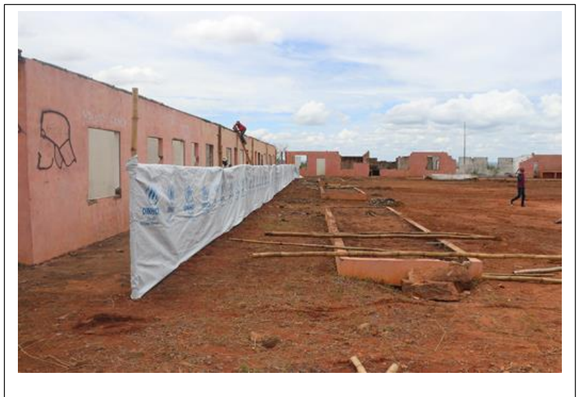
The new transit centre, Lunda Norte, March 2018