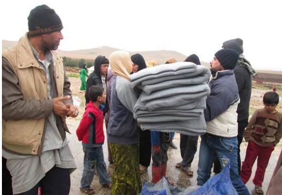
ACTED blanket distributions in northern Jordan