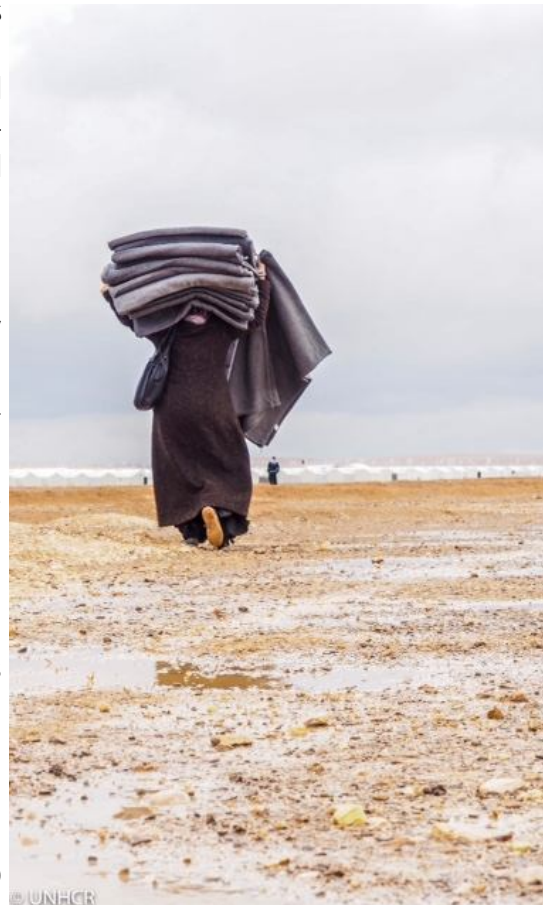
Elderly woman receives UNHCR blankets in Azraq