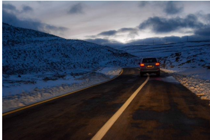
Government public and emergency services have cleared roads across the affected parts of the country

Despite the harsh weather conditions and the movement restrictions, the Government of Jordan and humanitarian partners have mobilised and delivered an effective response.