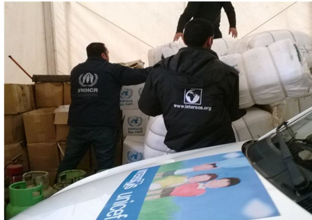
INTER-SOS teams preparing for distribution of non-food items in Irbid area