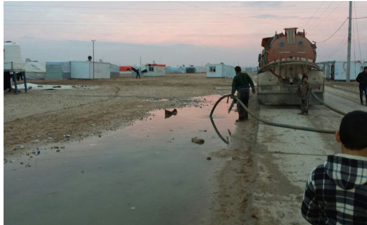
JEN trucks operating out of Zaatari