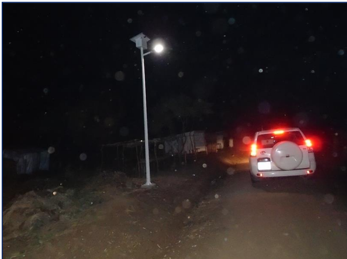
Bidibidi Settlement, additional solar street lights are being installed in Zone 2 for improved safety and security, Nov 2016.

114 community awareness raising sessions were conducted by SGBV Refugee Outreach Volunteers (ROV) reaching out to 13,444 refugees (5,788F/7,656M) in Zones 1, 2, 3 & 4. This brings the total number of awareness raising sessions in Bidibidi to 540, reaching 44,819 refugees (18,066 M / 26,753 F) with SGBV prevention messages since the onset of the emergency. During community awareness sessions, SGBV prevention and response messages (e.g. forms of SGBV, causes and effects of SGBV, referral mechanism for appropriate response) are shared. This has resulted in