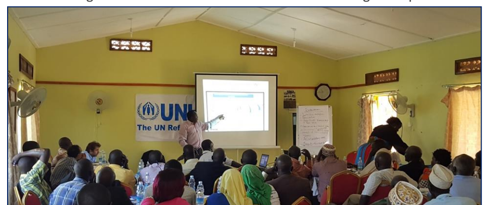
Yumbe, RDO presentation of Ugandan Policy on Refugees & Asylum Seekers as the opening session of a Protection Training for district authorities, 1 Nov 2016.