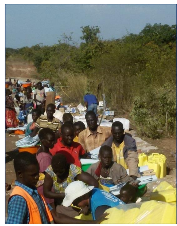
Bidibidi Settlement, distribution of CRIs to newly-arrived refugees from South Sudan, 4 Nov 2016.

A training was conducted for 149 Protection volunteers, assistants and others on PSN referral pathways vulnerability categories, codes and restoring family links.