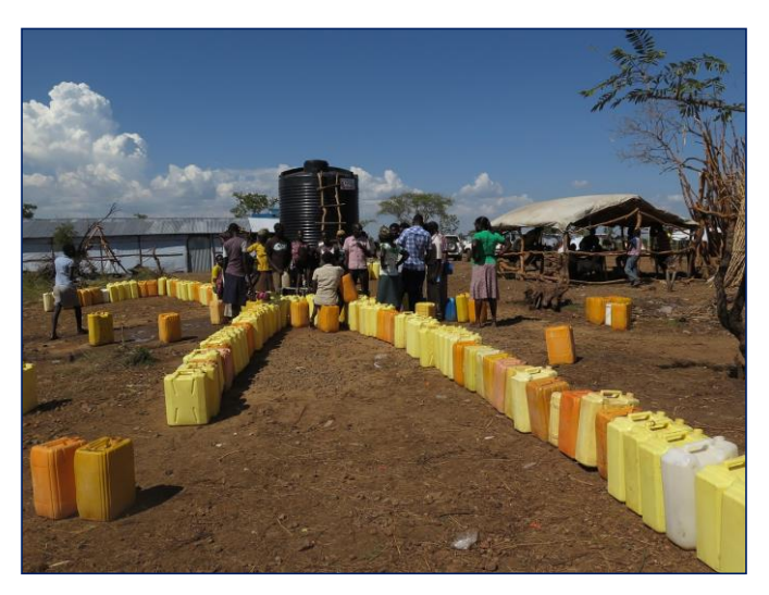
Rhino Settlement. line of ierry cans at the water storage tank. Oct 2016.