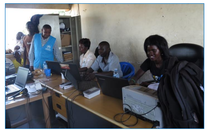
Ocea Reception Center, Biometric registration RIMS of newly-arrived refugees from South Sudan, Oct 2016.