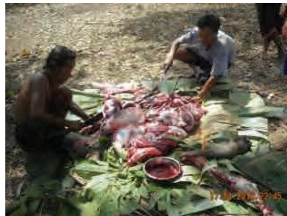
The photos above, taken on April 17 th 2012 in Htee Klay village tract, T'Nay Hsah Township, Pa'an District show a cow being butchered after stepping on a landmine that same day; the owner of the cow is holding the cow's dismembered leg in the photo at left. Since the beginning of 2012, residents of only one village in Htee Klay village tract recorded a total of 17 livestock animals injured by landmines, and five human casualties, including one who subsequently killed himself. 80