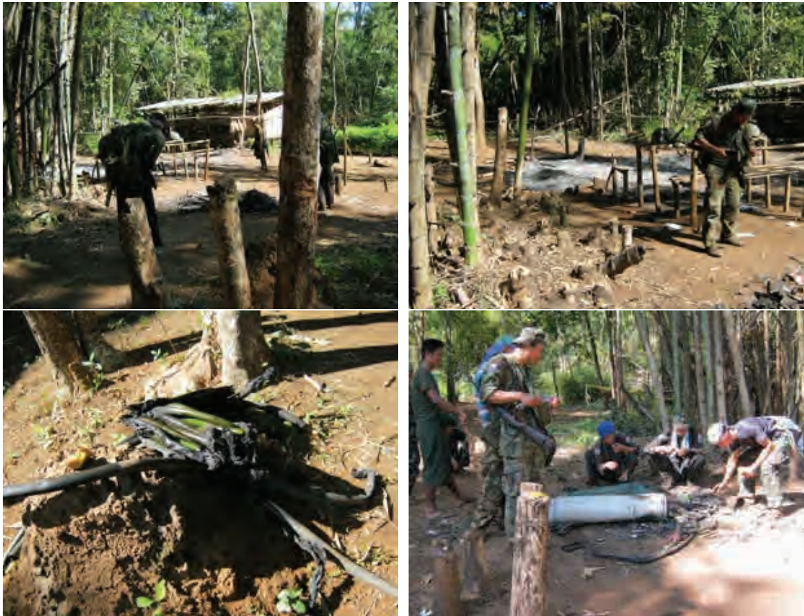
These four photos, taken in December 2010, show KNLA soldiers de-activating and removing a landmine in Kyaw Pyah village tract, Mone Township, Nyaunglebin District, which was placed by Tatmadaw LIB #599 and IB #48 soldiers, after they patrolled in the area and burnt down a KNLA camp.