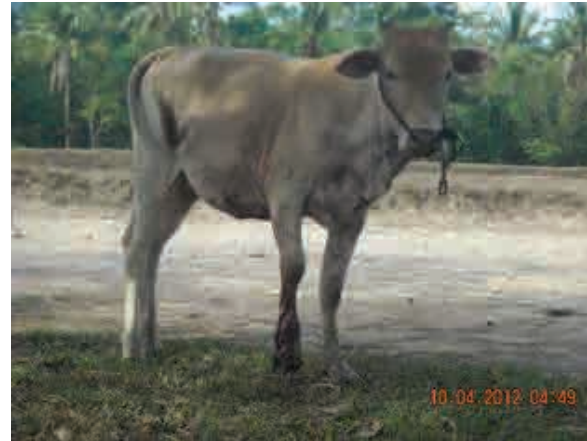
The photo above left, taken on April 10 th 2012, shows a site near Thaw Waw Thaw village in Noh Kay village tract, T'Nay Hsah Township, Pa'an District where Saw Hn--- stepped on a landmine while going fishing. On the same day that these photos were taken, the cow (above right) stepped on another landmine within twenty feet of the location where Saw Hn--- was injured. 79