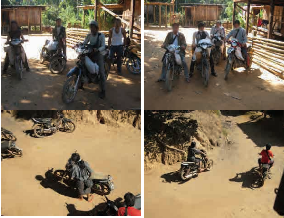
The four photos above taken in November 2011 in Tantabin Township, Toungoo District, show motorcycle drivers who had to transport supplies and equipment to support Tatmadaw MOC #9 road-building activities using their own motorcycles. According to the community member working with KHRG who took these photos, the motorcycles were ordered to drive in front of the bulldozer in areas suspected to be mined during the construction of the new vehicle road from Kaw Thay Der to Naw Soe, leading the motorcycle drivers to suspect they were being used to clear landmines from the intended course of the new road. 166