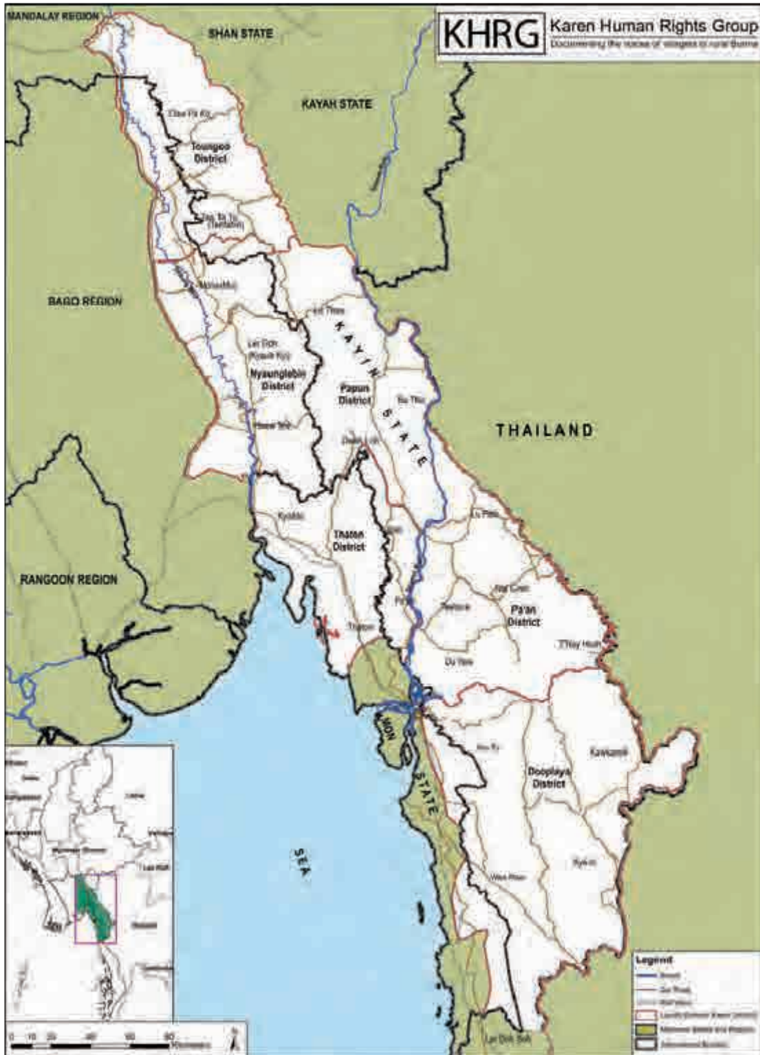
Figure 1: Locally-defined Karen districts (Kayah and Mon states; Bago Region)