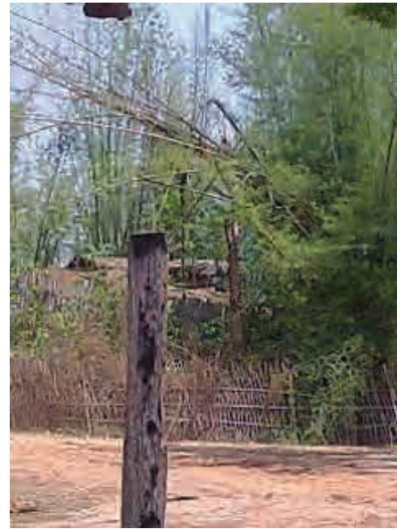
The photos above, taken in March 2012, show the Tatmadaw camp beside U Kray Hta village in Dooplaya District and three bulldozers parked in front of the camp. These three bulldozers were used to clear landmines planted in U Kray Hta village and on the vehicle road. According to the community member working with KHRG who took these photos, the clearing of the landmines was not systematic or complete, and at least some landmines still remain in and around the village, including in the U Kray Hta school compound. The vehicle road from which some mines were cleared by the bulldozers is visible in the foreground in both photos. 129