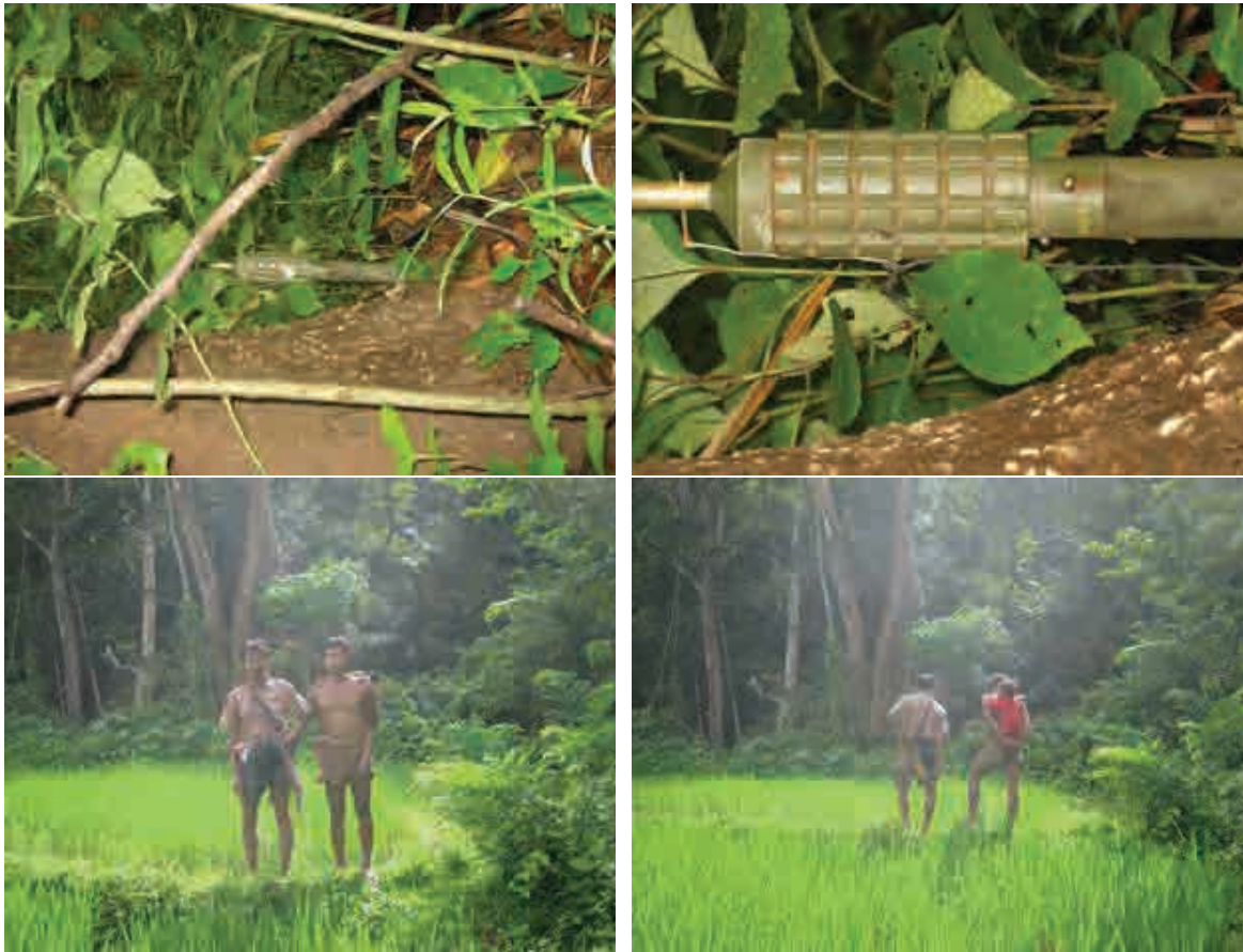
These four photos were taken in September 2011 in Bu Tho Township, Papun District. The top photos show a Burmese-made MM-1 stake fragmentation mine planted beside a flat field paddy farm, close to Boh Hta village. According to a Boh Hta village representative, the landmine was planted by Tatmadaw LIB #240 soldiers during September 2011. The owners of the flat field next to which the mine was planted (shown in the bottom two photos with a child) told the community member who took these photos that they worried that their cows and buffalos would step on the mine and, as a result, had to keep an especially close watch on them. 44