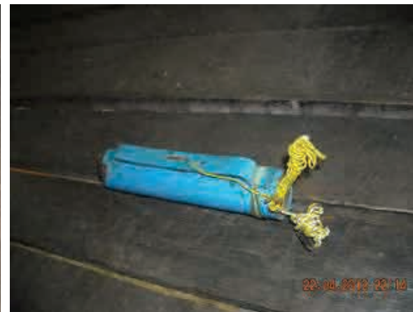
The photo above left shows a landmine removed and destroyed by Thee Wah villagers in April 2012 in response to threats to local villagers and livestock. According to the community member working with KHRG who took these photos, Thee Wah villagers dug out this mine, and approximately 20 others, using a long stick wherever they saw a mound of freshly-turned earth. They then deactivated the mine by removing the wire and cutting off the cap with a machete to remove the gunpowder inside, which was used to make homemade bombs attached to a remote-detonation device for use during fishing. The gunpowder removed from the landmine is being stored inside the blue plastic bag (above left). The photo at right shows a landmine of the type planted by Tatmadaw Border Guard troops in T’Nay Hsah Township that was removed by Tatmadaw Border Guard soldiers at the request of local villagers in March 2012, along with about 20 or 30 others, before a soldier was injured by a landmine and plans to remove the mines were abandoned. In the photo above right, the detonation trigger button is visible in the middle of the mine. 128