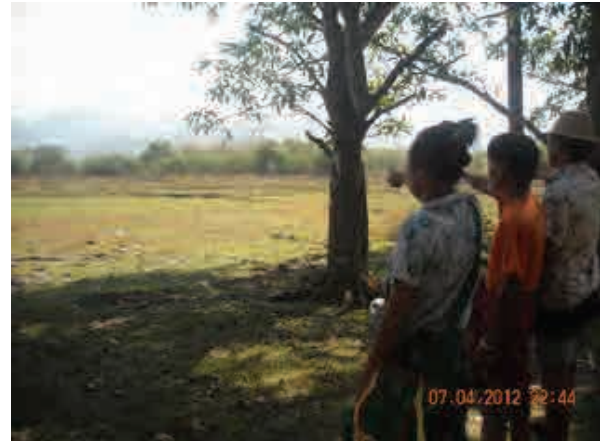
The photo above left shows two male villagers from Noh Kay village tract, one of whom was injured in 2005 (left) and one of whom was injured in 2010 (centre). The woman on the right, Ma Nu---, 33, stepped on a landmine near Noh Kyaw village while she was looking for firewood. In the photo at right, all three villagers are indicating an area near Thee Wah village that continues to be contaminated by mines. 127