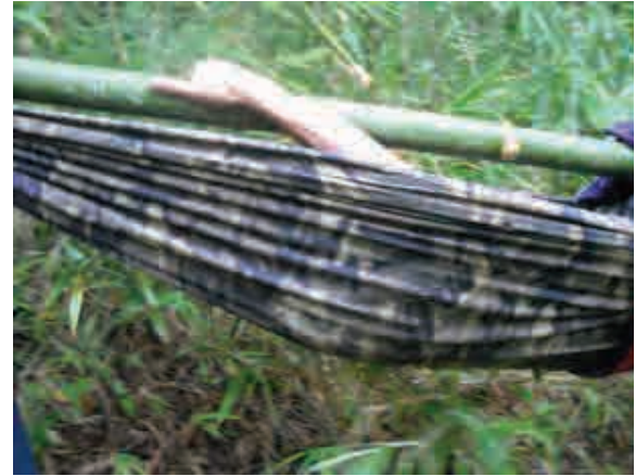
The photos above were taken on September 11 th 2011. They show villagers in Lu Thaw Township crossing the Kyaukkyi – Saw Hta vehicle road, while carrying a 45-year-old Am--- villager named Saw Mu--- who stepped on a landmine near his hill field in Hee Oo Htaw on August 30 th 2011, at approximately 1:50 pm. 208