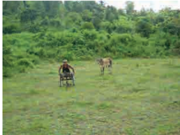
These photos, taken on October 16 th 2011, show a Fe--- villager in Mone Township, Nyaunglebin District who lost both of his legs when he stepped on a landmine and now looks after cattle for other villagers to support his livelihood. 207