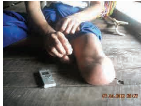
The photo above left shows Wh--- from Noh Kay village tract who was injured in November 2011 by a landmine planted near his paddy field. 202