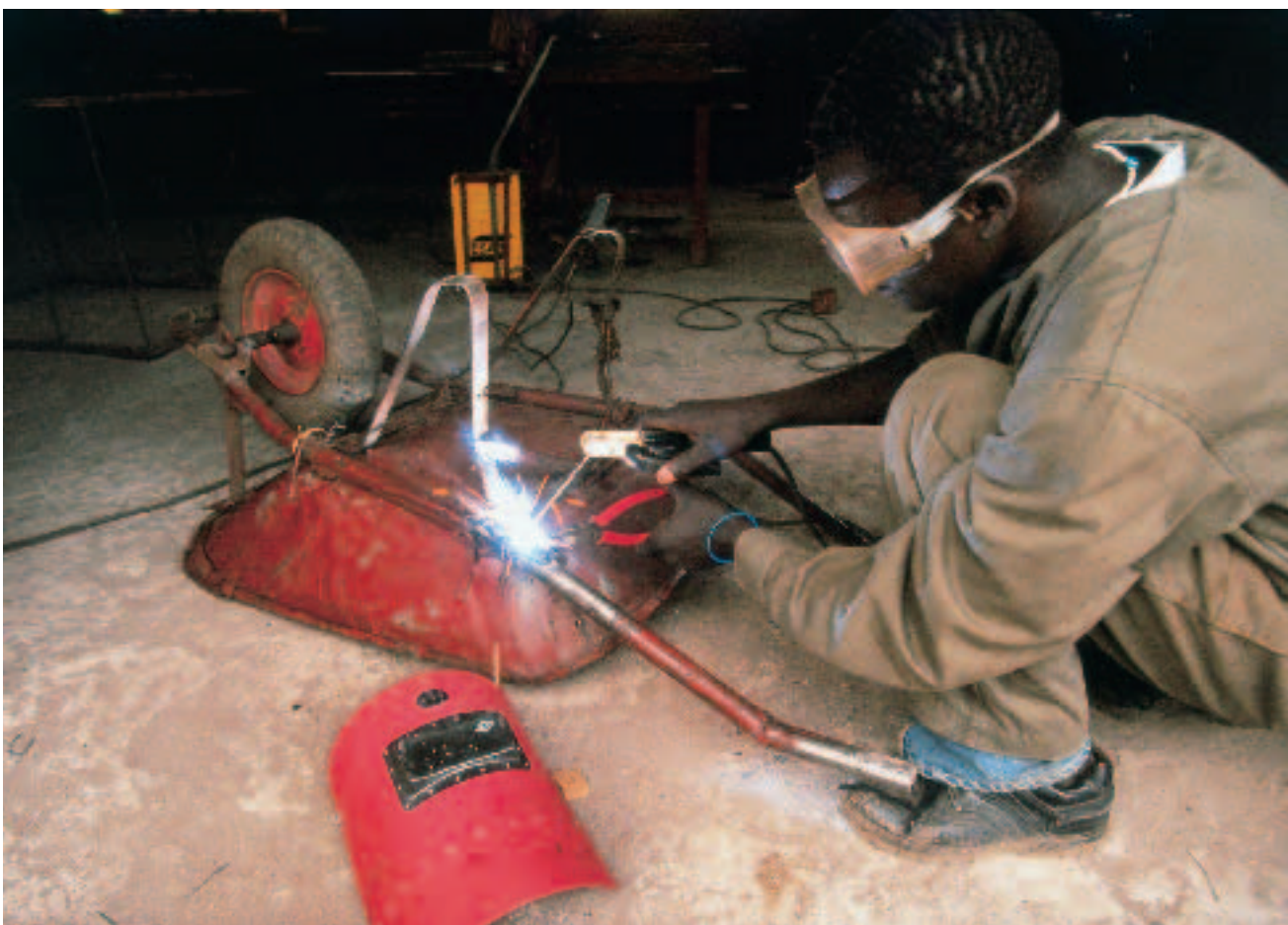
Sudanese refugee in the vocational training centre in Bonga camp, Gambella.

Domestic needs/household support: UNHCR distributed more than one million pieces of soap, 65,500 jerry cans, 32,850 blankets, 19,120 pieces of plastic sheeting, 6,375 kitchen sets and 6,000 items of second-hand clothing to Somali, Sudanese and Eritrean refugees. Urban refugees also received