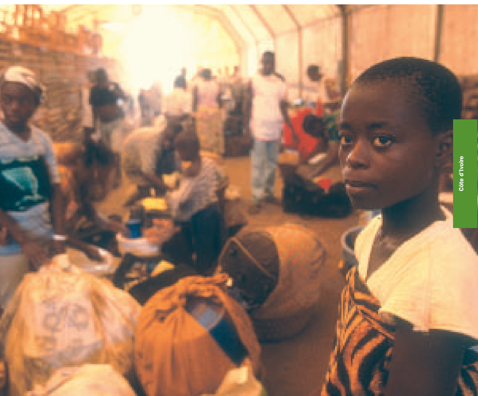
Liberian refugees at a transit camp in the Tabou area waiting for transportation to go home.

Therefore, 57 wells and 191 latrines were rehabilitated or constructed, benefiting 26,253 refugees and 8,950 local residents. Water and sanitation committees were established to manage the infrastructure and educate the end-users.