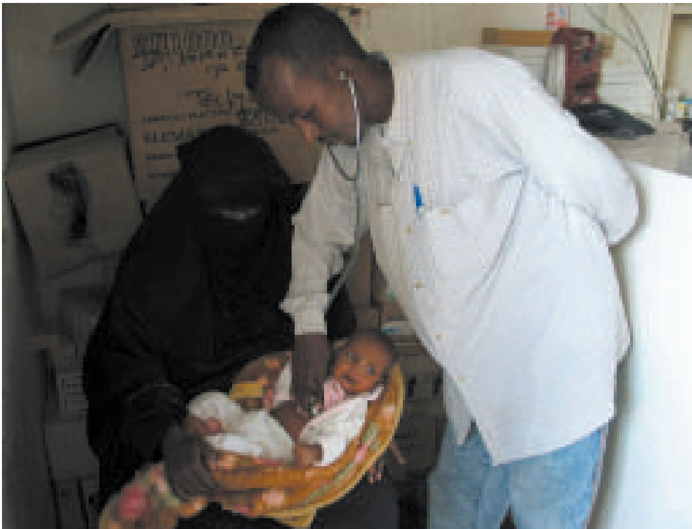
A young pharmacist in Galkayo, who returned to Puntland after eight years in a refugee camp in Kenya, examining a dehydrated baby boy brought in to the pharmacy by the baby's mother.

most returnees from Djibouti and Ethiopia, and workshops were conducted for farmers on sound agricultural techniques. In addition, a total of 5,500 individuals benefited from the distribution of tools and seeds for vegetable gardens and cereal production.