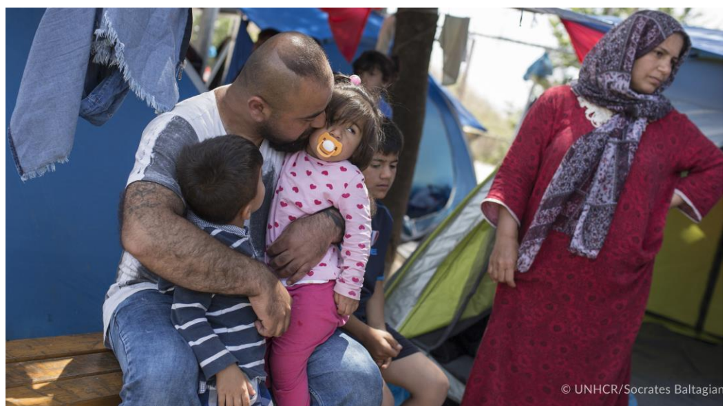
An Iraqi family at the Diavata site near Thessaloniki. The family crossed into Greece via the Evros River.

6 Island Offices in Lesvos, Chios, Samos, Leros, Kos, Rhodes