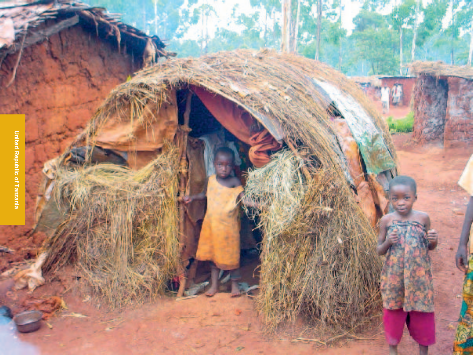
Tanzania: Refugees from Rwanda and Burundi living at Lukole camp, Ngara.