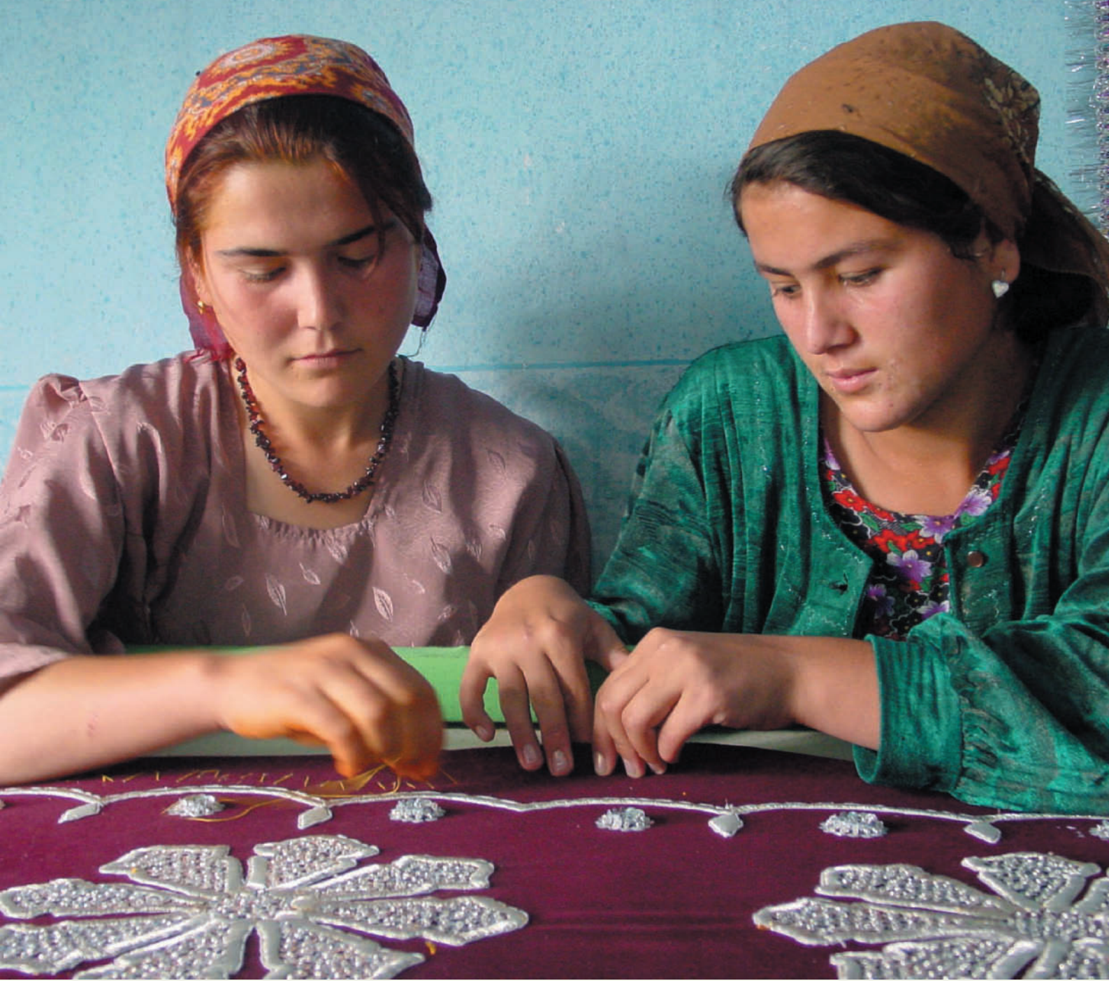
Tajikistan: In 2005, UNHCR help set microcredit programmes like this one to help returnees reintegrate into their communities.