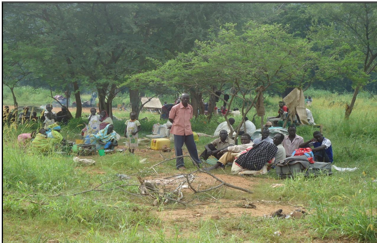
Hangars and emergency tents are being erected at the entry points to temporarily shelter the new arrivals from Sudan such as those seated under tree sheds along the border.