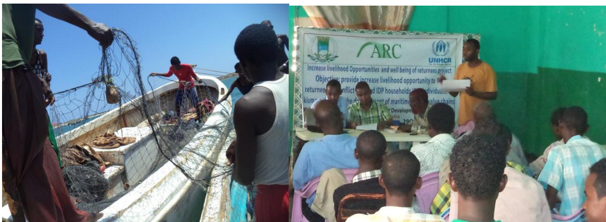
Training on fishery activities in Kismayo