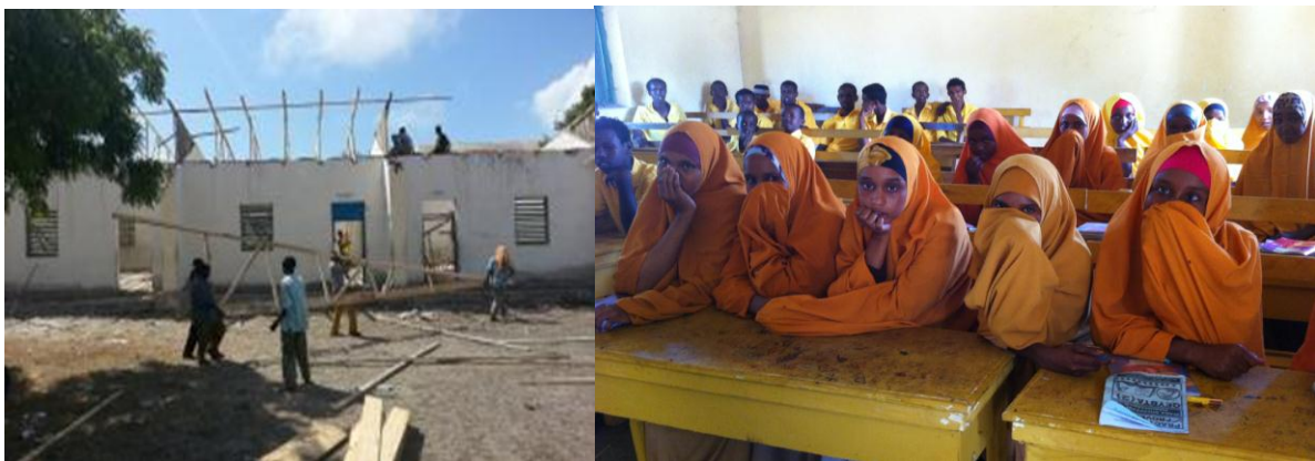
Rehabilitation of primary schools in Kismayo/UNHCR