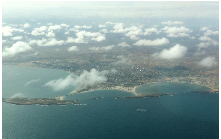
Aerial view of Kismayo