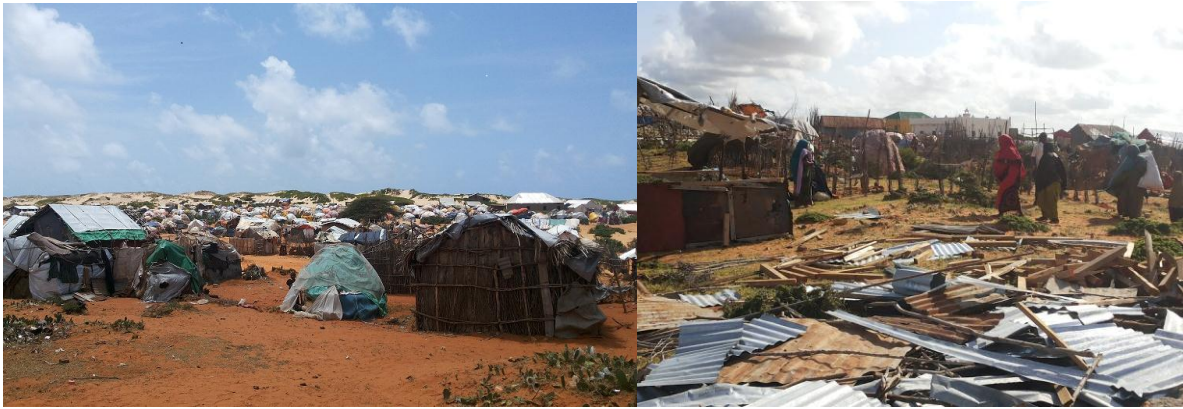
IDP settlements affected by floods in Kismayo