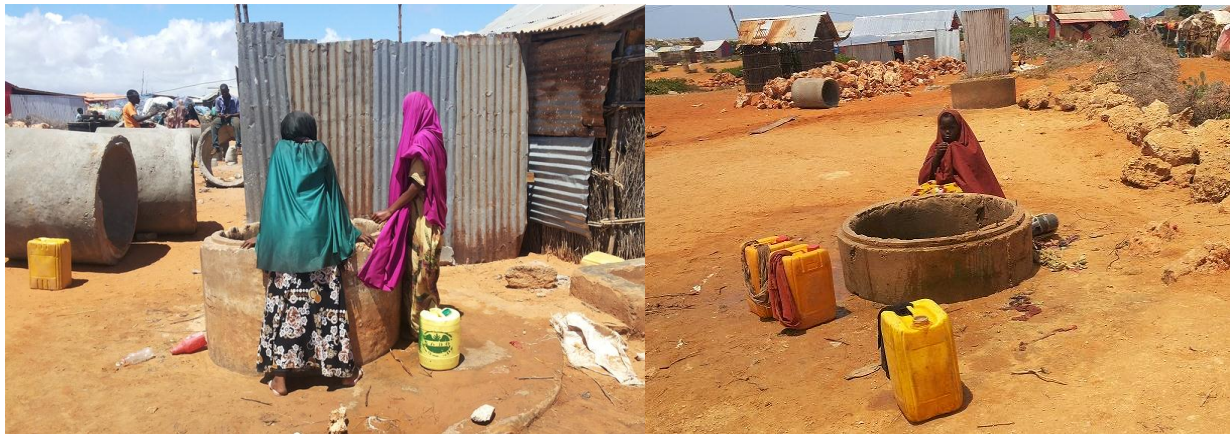
Rehabilitation of wells in Kismayo

city through the rehabilitation of 53 water points, construction of 25 latrines, and hygiene promotion activities in Faanole, Farjanno, Calanley and Shaqallaha areas.