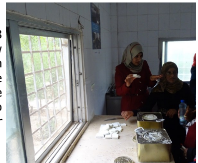
Photo: Jordanian women training in dairy production