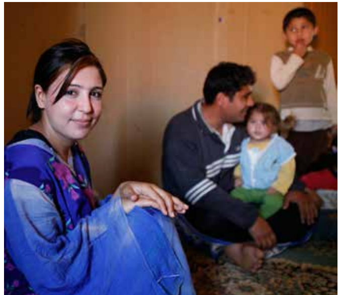
Marriage and birth certificates enhance the protection of women and children by securing their rights to family unity.

Syrian nationals in Turkey registered by the government as Temporary Protection beneficiaries enjoy free access to all forms of maternal health services, including prenatal, delivery and post-natal care, as well as prescription medication. With the issue of transportation identified as a challenge for some refugees, the government has instituted transportation assistance to bring pregnant who reside in camps to hospitals to ensure safe deliveries and the issuance of medical birth notifications.