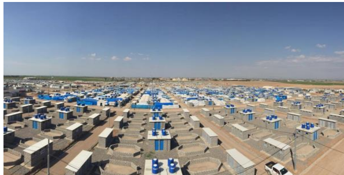
Qushtapa refugee camp overview in Erbil Governorate.

776 cases were referred for multi-purpose cash assistance in April from Erbil, Dohuk and Sulaymaniah governorate. Serious medical condition, child at risk, and physical/medical disability were reasons for 75% of the referrals.