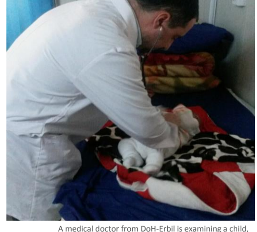
A medical doctor from DoH-Erbil is examining a child, Darashakran refugee camp PHCC, Erbil