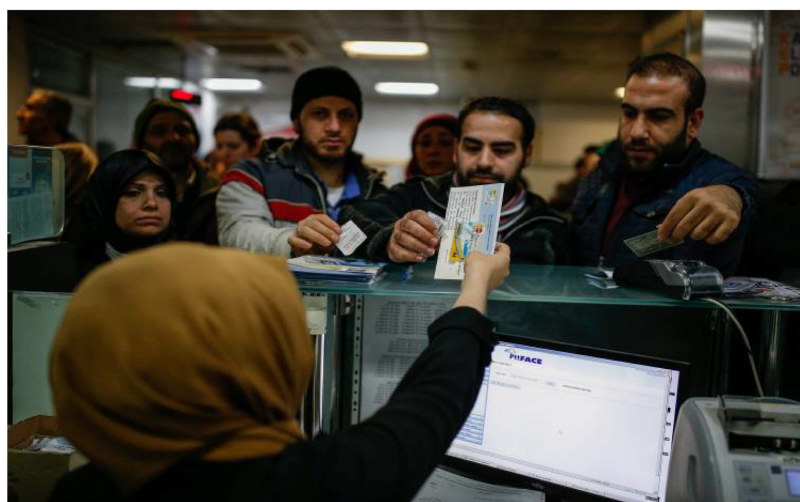
Card distribution at a PTT Office in Istanbul, Turkey. December 2016.