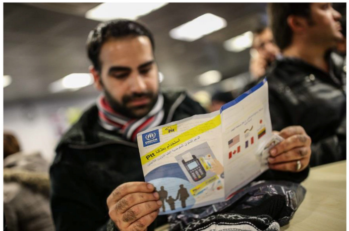
Card distribution at a PTT Office in Istanbul, Turkey. December 2016.