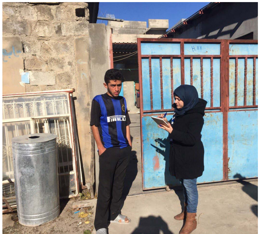
An enumerator of Erbil Statistics Office (ESD) is using an on-line data collection tool for the first time during the interviews for the household survey for profiling. Dec. 2015, Erbil, KR-I.

availability and capacity in the targeted areas.