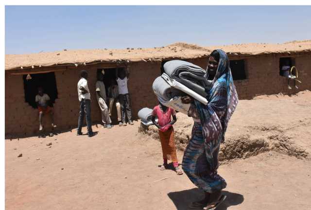
South Sudanese refugee woman returns to her home in an ‘open area’ settlement in Khartoum after receiving her NFI package. El Naiem/ UNHCR/April 2018.

– COR has confirmed that UN, INGO and NGO response partners will have sustained access to all ‘open areas’ to deliver assistance and complete assessments, as needed. This follows the completion of the inter-agency needs assessment of the ‘open areas’ in December 2017. Findings indicated significant protection, livelihoods, shelter and NFI needs, with health and education service gaps. Response recommendations were identified at a finalization workshop in March 2018. Partners are now moving forward to develop a response plan and mobilize resources to begin delivering humanitarian assistance.