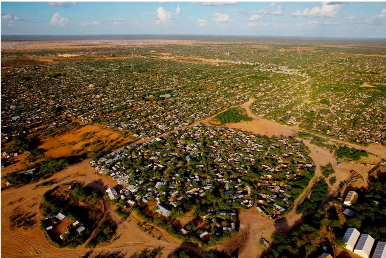
Ifo from the air