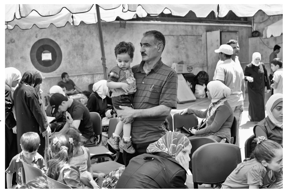
Syrian refugees registering for protection and other social services at UNHCR offices in the Zamalek neighbourhood in Cairo.

sufficient access to, and information on, registration and services available. Increased shelter support and livelihood interventions are recommended amongst other findings to increase the level of income, which will have a positive impact on housing and food security.