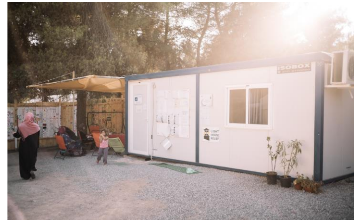
Women and Girls Safe Space, Ritsona, Greece