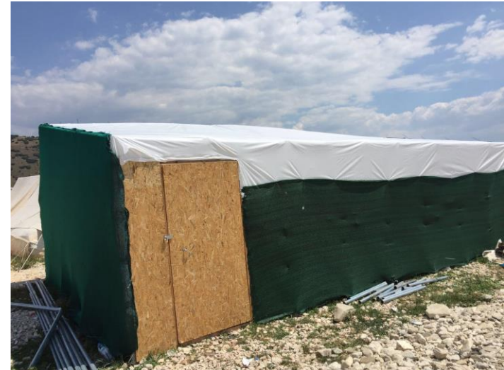
Women and Girls Safe Space, Katsikas, Greece