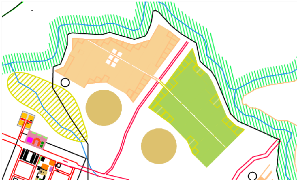
Village Layout with Agricultural Land