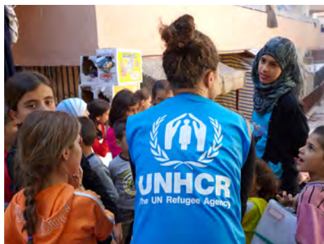
UNHCR staff speaks with a group of children in Chekka, Lebanon.