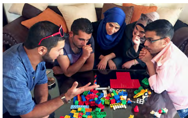
A Lebanese and Syrian youth group brainstorms projects that would benefit both communities.

The views of Lebanese and refugee communities are taken into account in the design and implementation of programmes aimed at supporting them. As a result, they weigh in on decisions that affect their lives and the communities in which they live, which strengthens their dignity. Through our support, communities become more effective in identifying solutions to their own problems and are able to prevent and address them with the help of relevant public authorities and institutions. While making them less dependent on external aid, this approach also enhances the accountability of humanitarian actors towards persons of concern, as it should be.