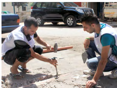
A construction project in South Lebanon will bring clean water to more Lebanese and Syrians in the area.