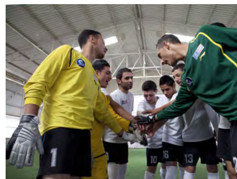
A football league of Syrian and Lebanese youth in North Lebanon meets twice a week with equipment provided by UNHCR.