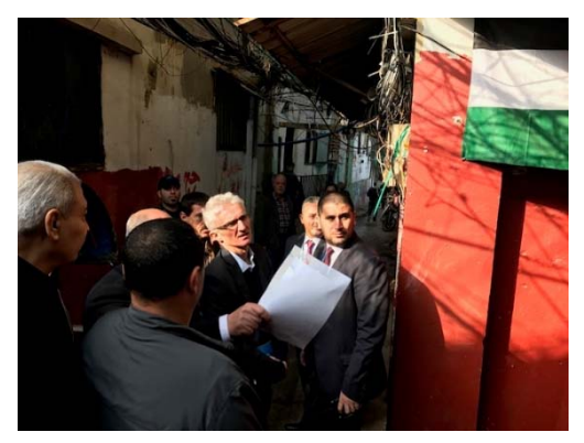
USG Lowcock touring Burj al-Barajneh camp after his meeting with refugees.

The situation in Burj al-Barajneh refugee camp, south of Beirut, reflects the severe challenges of daily life in Palestine camps across Lebanon where high numbers of Syrian (47.9 per cent of the total population inside the camp), Palestinian Syrian refugees (3.7 per cent) and Palestine refugees (44.8 per cent) endure extremely difficult living