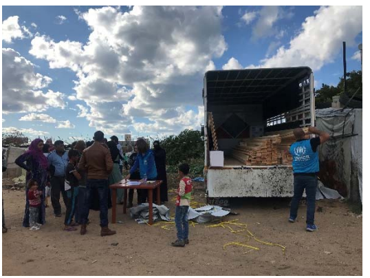
UNHCR staff unload building materials at an informal settlement in southern Lebanon.

The winter season is a double challenge for vulnerable families, as they have to deal with very difficult conditions in many of the basic dwellings, informal settlements or collective shelters live in, while having fewer opportunities for casual income to support their families because of the lack of agricultural activity in winter.