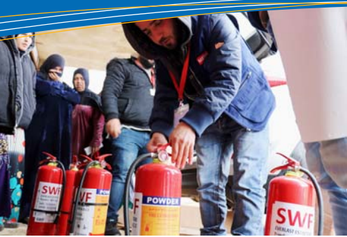
Distributing fire extinguishers in the Bekaa.

Welcome to the first Humanitarian Bulletin of 2018! In this issue, discover the Humanitarian Coordinator's key priorities for this new year. We also look at some of the key results of the 2017 LCRP and the Lebanon Humanitarian Fund, while shining the spotlight on the UNRWA funding crisis. Finally, find out how a Syrian refugee family survived a fire, with support from the NGO Medair.