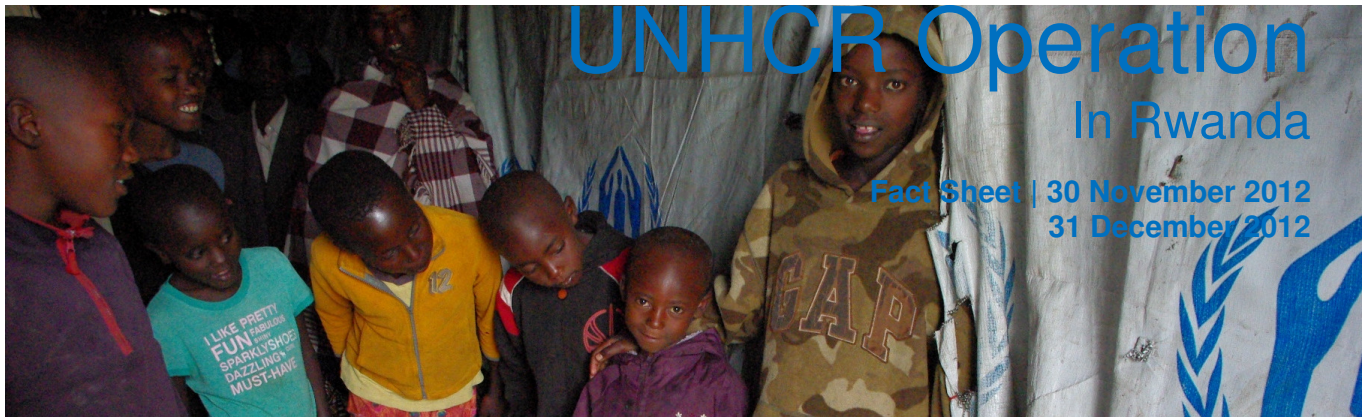
Children at Nkamira Transit Centre awaiting transfer to Kigeme Camp, after fleeing from the November fighting in Eastern DRC