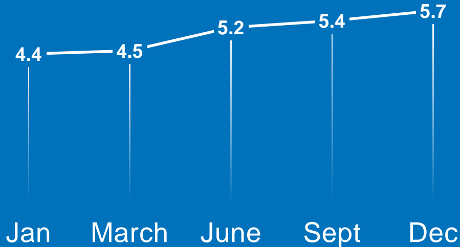
AVERAGE DAILY WATER SUPPLY, GAMBELLA CAMPS 2017, IN MILLION LITRES