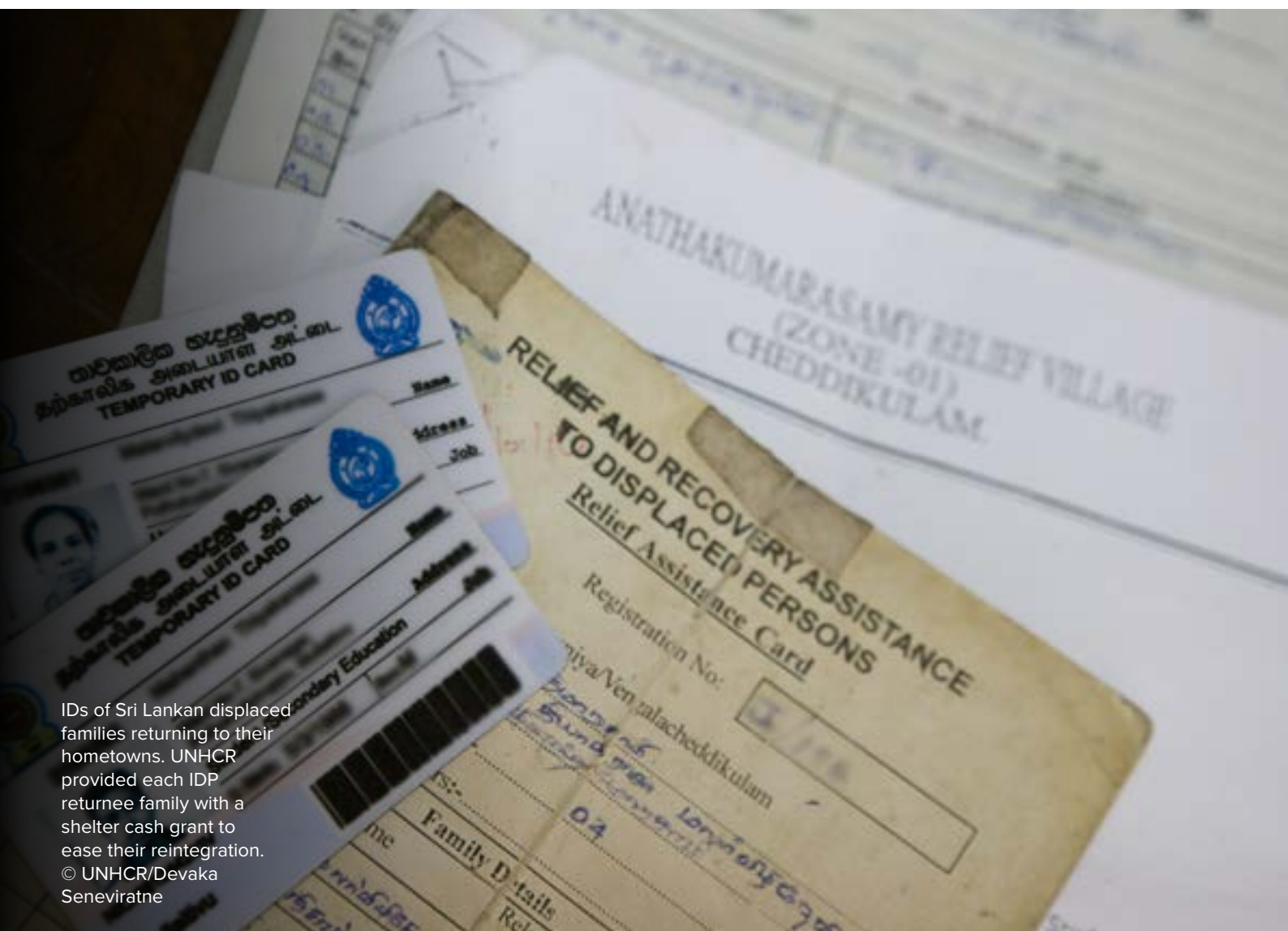
IDs of Sri Lankan displaced families returning to their hometowns. UNHCR provided each IDP returnee family with a shelter cash grant to ease their reintegration.

Under Objective 3, UNHCR will also strengthen preparedness for the delivery of CBIs in emergencies and will improve inter-agency collaboration through the development of common approaches to cash delivery with UN and NGO partners. Through these efforts, UNHCR will also expand financial literacy and knowledge among both UNHCR and partner agency staff, as new financial solutions are developed and delivered.