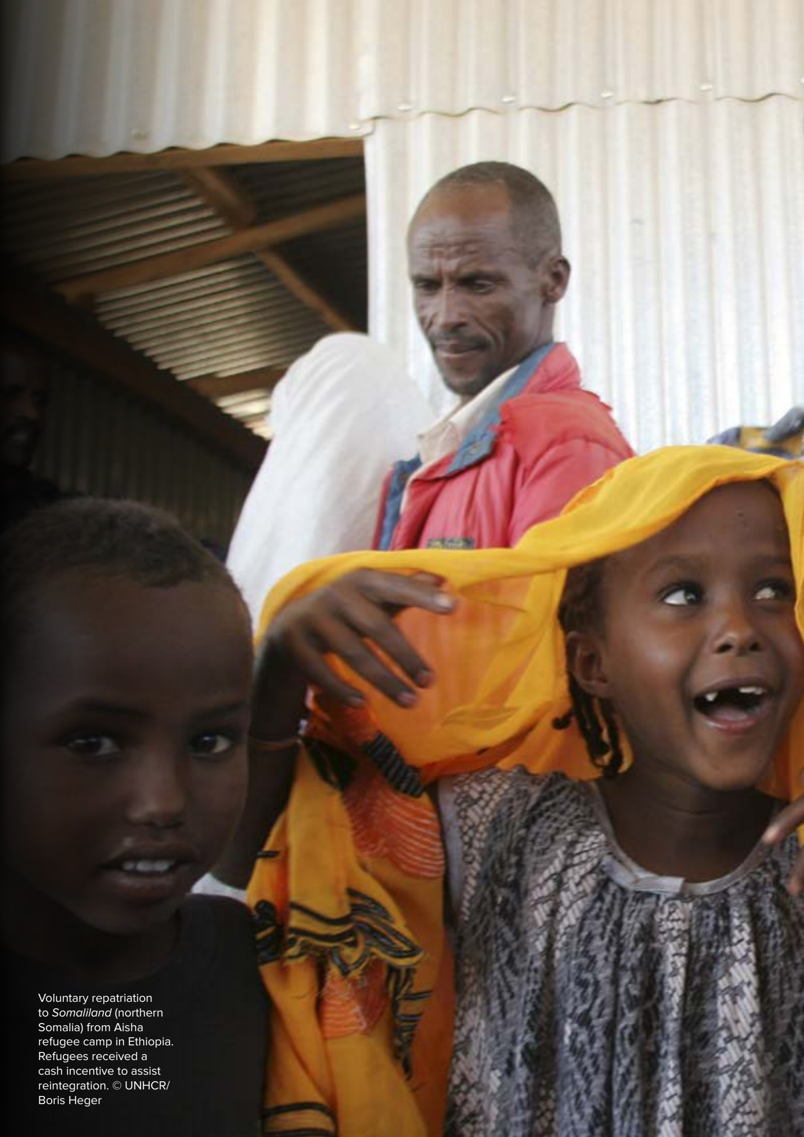
Voluntary repatriation to Somaliland (northern Somalia) from Aisha refugee camp in Ethiopia. Refugees received a cash incentive to assist reintegration.