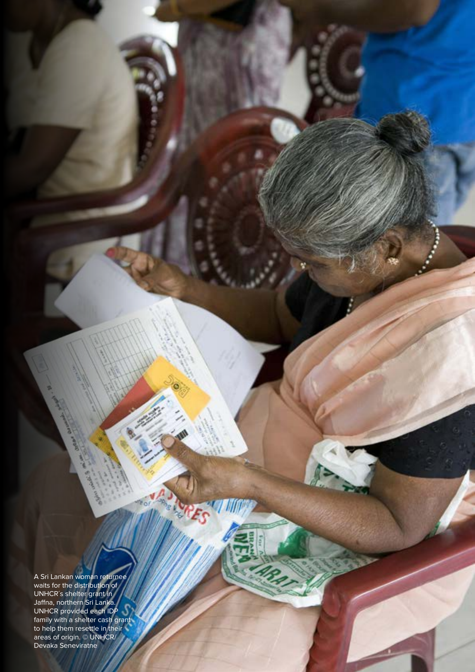
A Sri Lankan woman returnee waits for the distribution of UNHCR's shelter grant in Jaffna, northern Sri Lanka. UNHCR provided each IDP family with a shelter cash grant to help them resettle in their areas of origin.