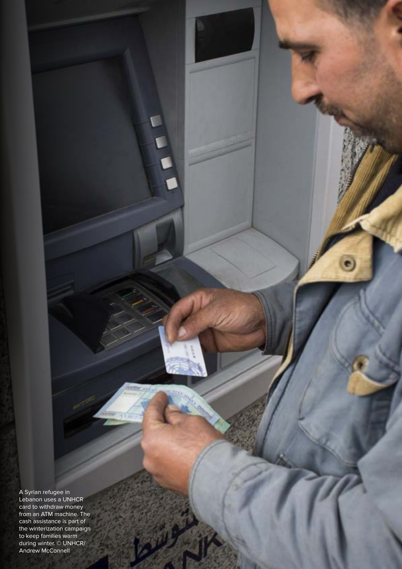
A Syrian refugee in Lebanon uses a UNHCR card to withdraw money from an ATM machine. The cash assistance is part of the winterization campaign to keep families warm during winter.