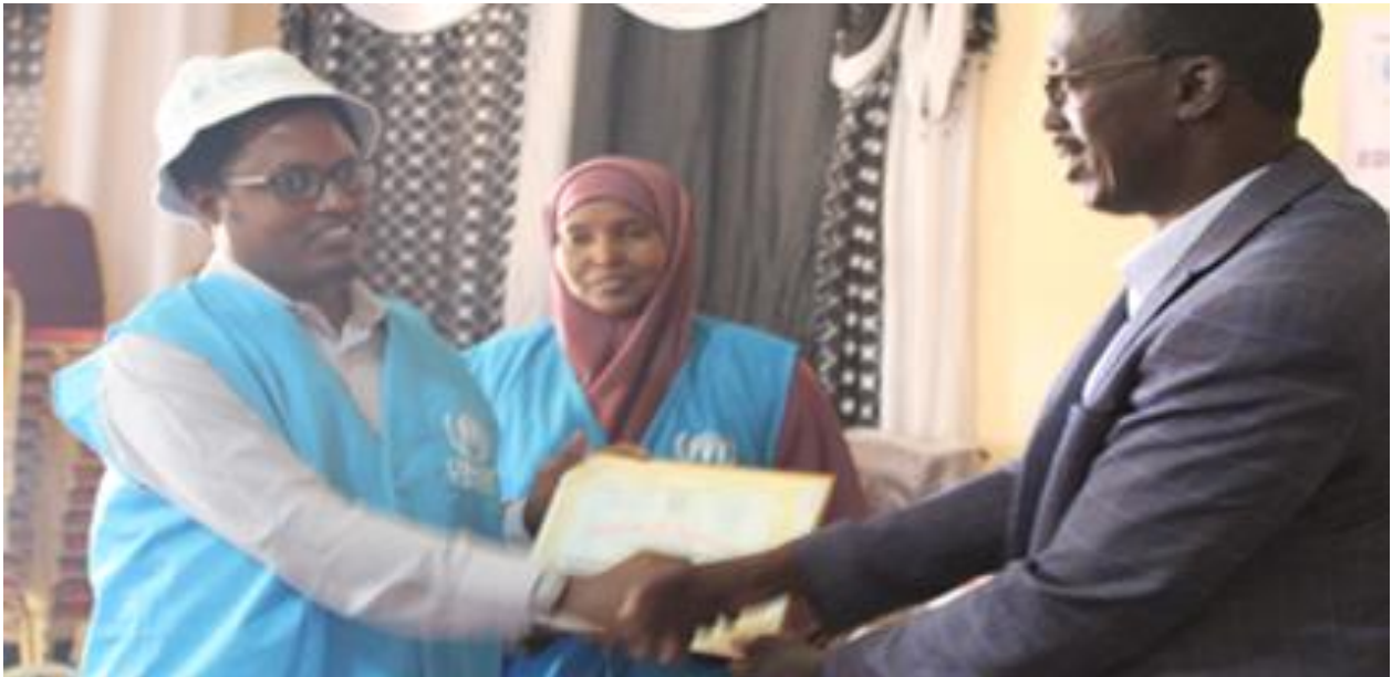
UNHCR staff members receiving a certificate of appreciation from the Mayor of South Galkacyo.

UNHCR received a certificate of appreciation from the Mayor of South Galkacyo, the State of Galmudug, in recognition of UNHCR contribution for drought response and support to local authorities.