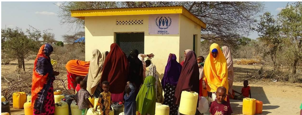
People affected by the drought receiving water from the borehole in Dhobley.