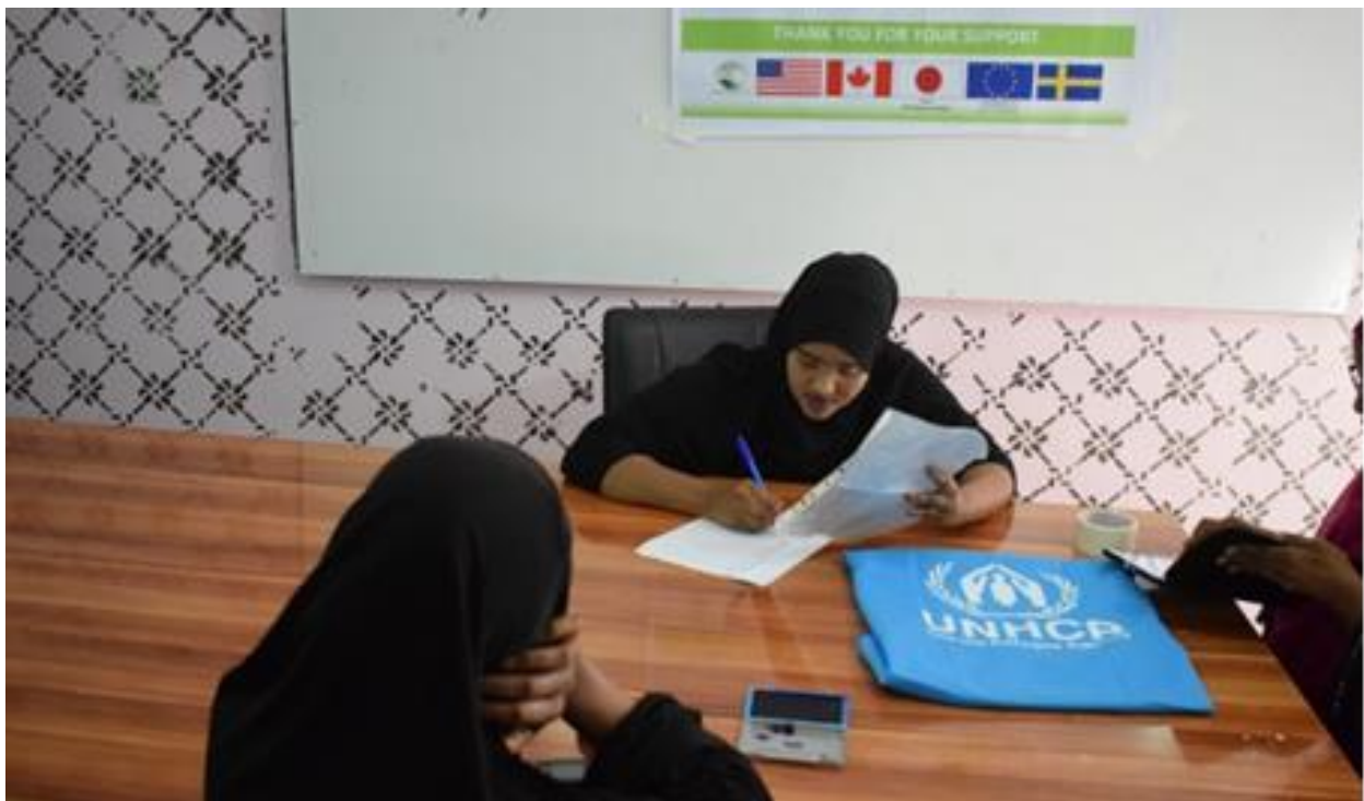
UNHCR partner enrolling beneficiary in a learning program at the Peaceful co-existence centre in Hargeysa.